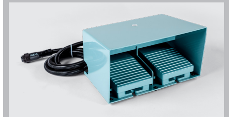
Foot pedal as an option (factory installation only).