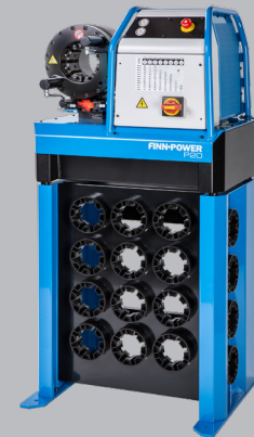
Tool base (20 slots) with QuickChange-tool as an option.