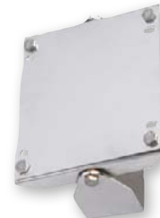
Art.no. 9760 Art.no. 9765