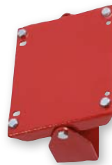
Art.no. 9767 Art.no. 9768