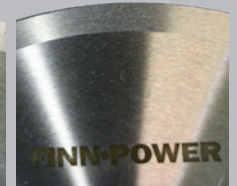
Smooth blade as an option.