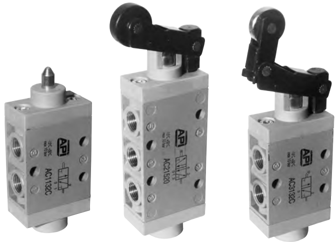
Series of spool valves mechanically operated (plunger, bi-directional and uni-directional lever)