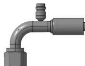
O-ring female swivel - R134a valve - 90° elbow