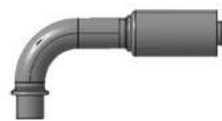
O-ring - tube connection, without nut, 90° elbow

Sonder Armaturen auf Anfrage Special fittings on request Raccords spécifiques sur demande