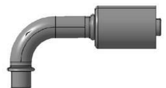
O-ring - tube connection, without nut, 90° elbow

Sonder Armaturen auf Anfrage Special fittings on request Raccords spécifiques sur demande